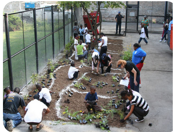
Community members install rain gardens at affordable housing units on Chicago's West Side.

Students at Lake Hills Elementary School in Michigan City, IN, planted rain gardens in their schoolyard to help reduce flooding. Students learned about plants, soil, and pollinators as well as how to care for the small habitats they created.