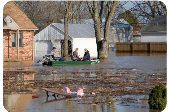
Residents evacuating their flooded home by boat in Dutchtown, MO, in 2008.

Runoff from a storm can carry many kinds of pollution, including oil and gas that drip onto pavement, soil from exposed fields and empty lots, and fertilizer from lawns, farms, and gardens. When there is a lot of rain, storm sewers can be overburdened. Many midwestern cities have combined sewer systems that carry stormwater from the streets along with wastewater from sinks and toilets. When these systems are overwhelmed, untreated wastewater may be released from sewage treatment plants in "combined sewer overflow" events. In Chicago, these events can occur from as little as 1.5 inches of rainfall. Pollutants then